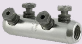
Mechanical Shear Off From LV to 72 kV - 1.5 mm 2 to 1200 mm 2