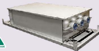
Joints with Separable Connectors From 10 kV to 42 kV - 25 mm 2 to 1200 mm 2