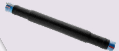
Heatshrink - Coldshrink From 10 kV to 72 kV - 25 mm 2 to 1200 mm 2