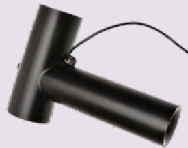
EPDM Rubber From 10 kV to 72 kV - 25 mm 2 to 1200 mm 2