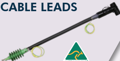
Testing options - Megger - HiPot - Partial Discharge From LV to 72 kV - 1.5 mm 2 to 1200 mm 2