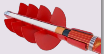
Heatshrink - Coldshrink - Slip On From 10 kV to 72 kV - 25 mm 2 to 1200 mm 2

For over 35 years Nexans Power Accessories Australia (formally Nexans Australmold), has supplied power accessories of the highest quality to Power Utilities, OEM's, Contractors, Approved Service Providers, Renewable Energy, Rolling Stock, Infrastructure and the Resources market.