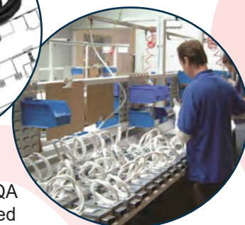
Factory QA controlled